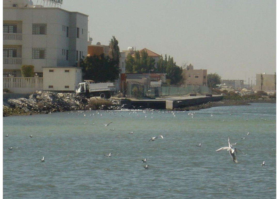
Fig. 7: Sewage effluents