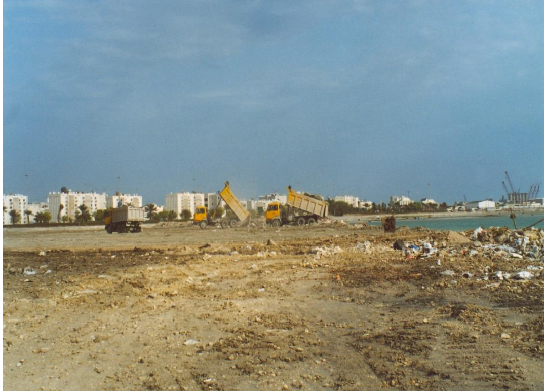
Fig. 6: Reclamation activities