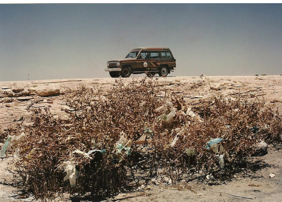
Fig. 8 & 9: Widespread degradation in mangrove plants