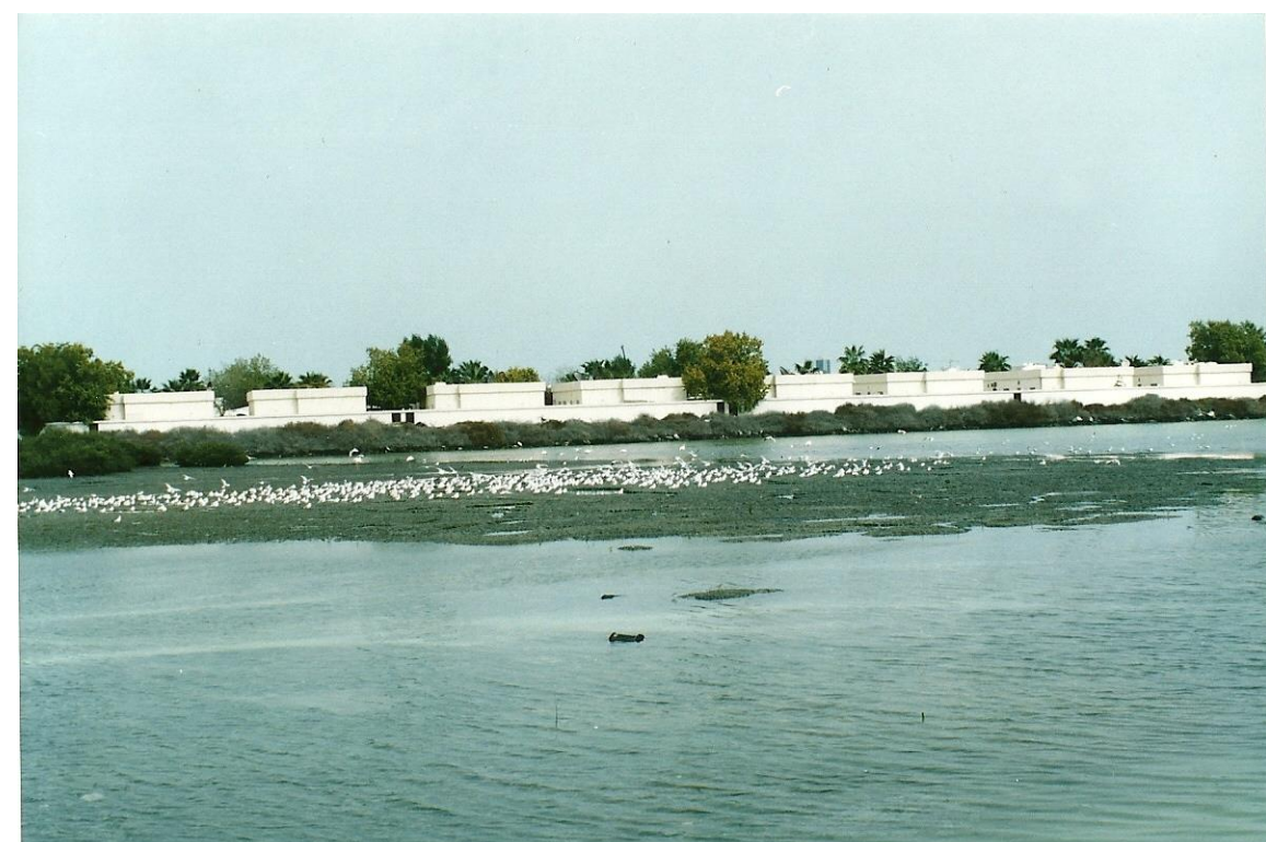
Fig. 5: Wader birds