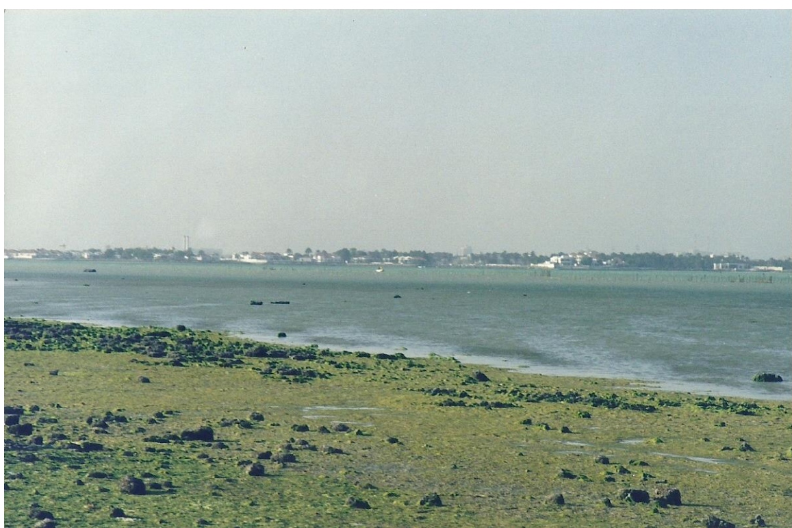
Fig. 3: Algal mats