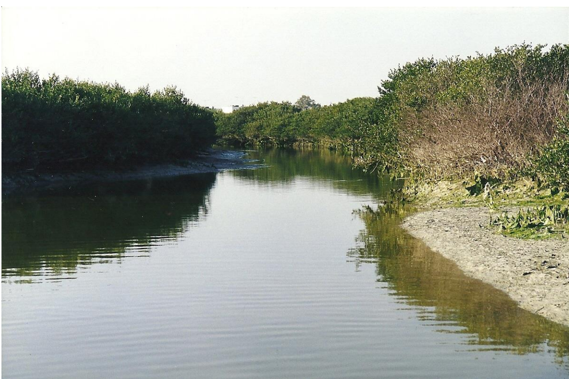
Fig. 2: Mangrove swamps