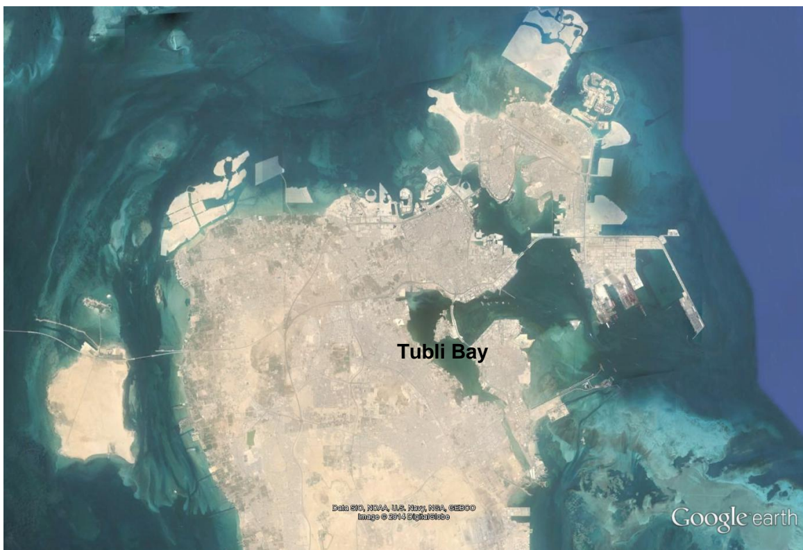
Fig. 1: Tubli Bay in Bahrain

Tubli Bay is a sheltered low-energy coastal area located in northeast of Bahrain (Fig. 1). This bay hosts a variety of coastal habitats such as mangrove swamps, seagrass beds, mudflats and patches of rocky areas. A sheltered lagoon in the bay that hosts the last remaining mangrove ecosystems in Bahrain is designated nationally as a marine protected area (1995). The bay represents one of the most important sites for migratory and breeding birds in the country (Ramsar site since 1997). The bay is also a nursing ground for economically important shrimps and fisheries (Fig. 2,3,4, and 5).